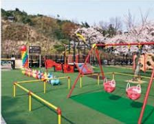
5 Kids corner