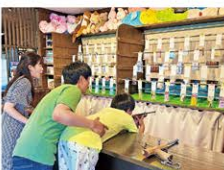
3 Yu-yu-kan (shooting gallery)