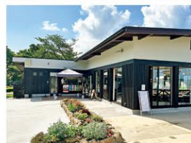
9 Panoramic view restaurant Enjoy a meal while looking at a stunning view.