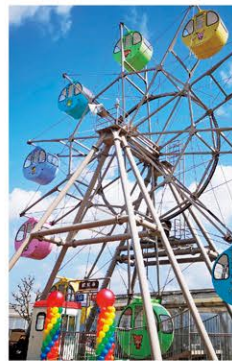
12 Ferris wheel