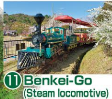
11 Benkei-Go (Steam locomotive)