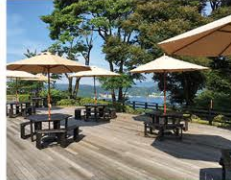
6 Wood deck