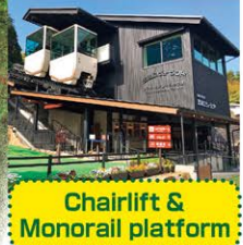
Chairlift & Monorail platform

There is a dedicated elevator for wheelchairs to the Monorail boarding area at the foot of the mountain